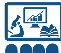
Research Based Framework